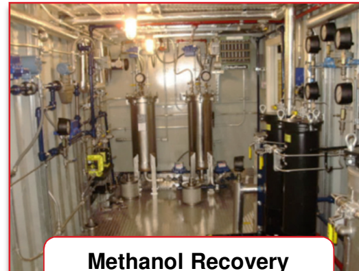
Methanol Recovery Facility Pilot Project

Developed Under Client's Green Technology Initiative