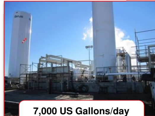
7,000 US Gallons/day LNG Plant