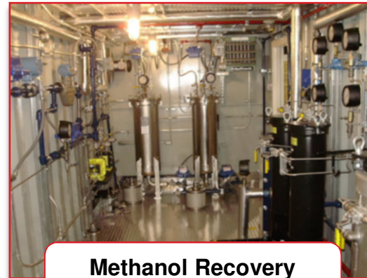
Methanol Recovery Facility Pilot Project

Developed Under Client's Green Technology Initiative