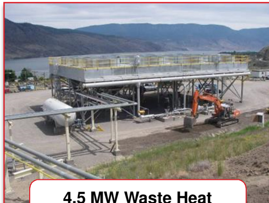
4.5 MW Waste Heat Recovery Power Gen